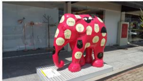
Elephants in Amsterdam, 2011