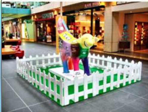
Bananas in Liverpool, 2008