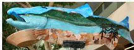
Salmon, Alaska, 2009