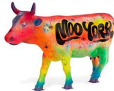
Cow Parade. New York. 2021.