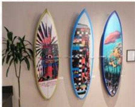
Surfboards on display at Paradox (now)

Idea: SC Pride "Surfboard" Art Parade 2025 - Growing from Cow Parade started in 1988