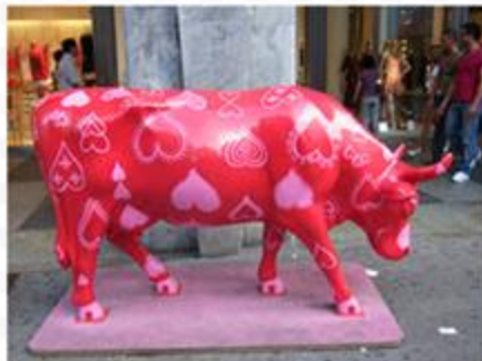
Cow Parade. Chicago. 1999