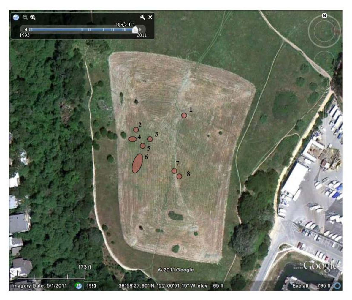
Census of Santa Cruz Tarplant, 8-9-11