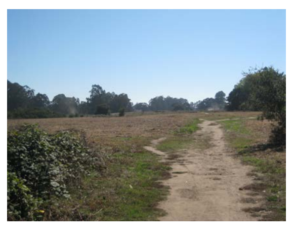
2 Photos of Mowing at Arana Gulch meadows (Fall 2011)