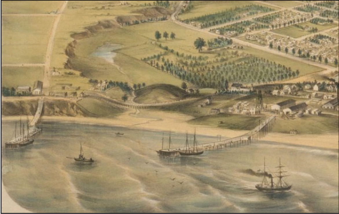
Bird's-eye view of Santa Cruz, 1870. The Cowell Wharf is on the left and the Powder Mill (formerly Gharky) Wharf is on the right. Note lack of the middle or "Railroad Wharf."