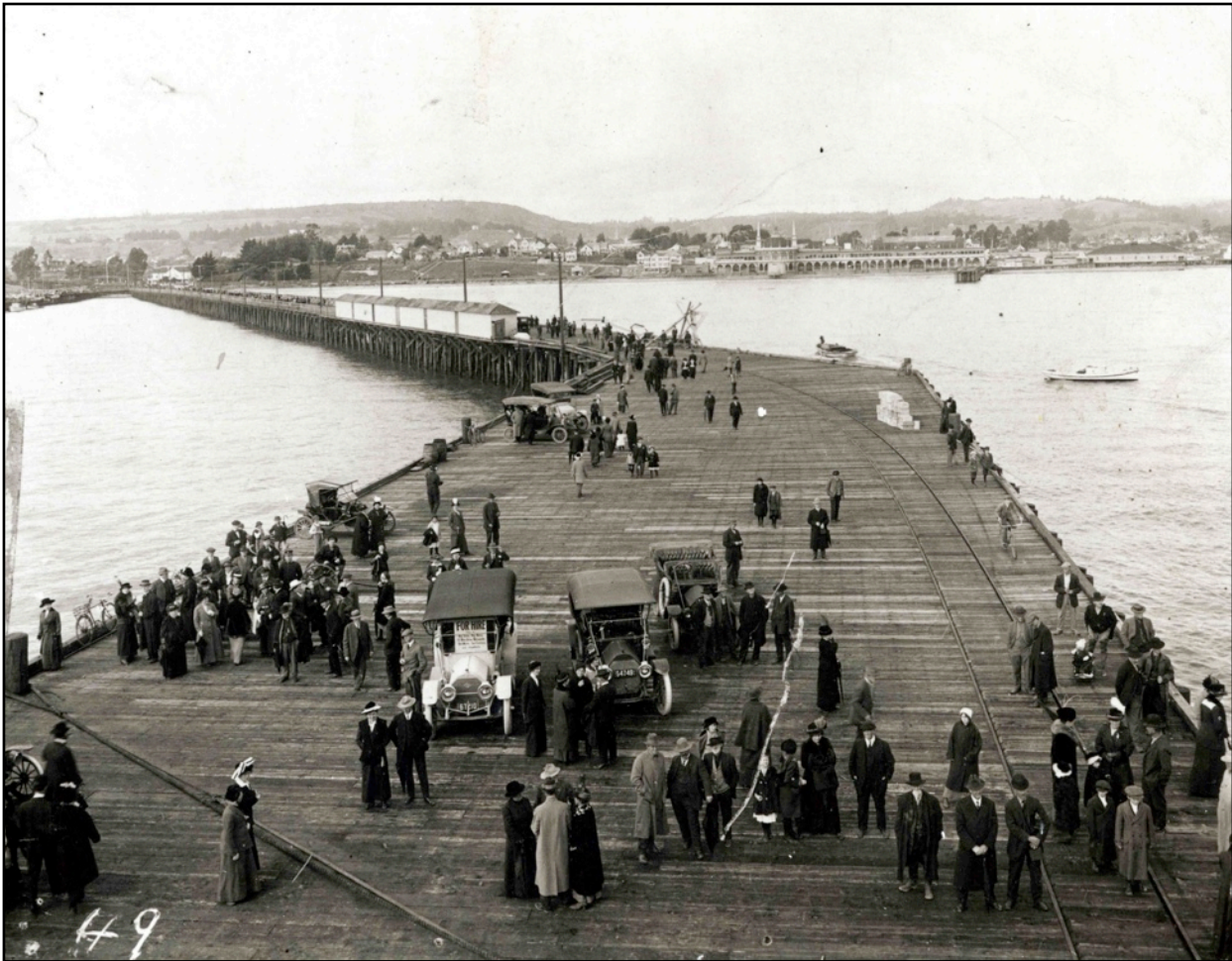
Municipal Wharf, built in 1914. In the distance on the far left is the old Railroad Wharf, built in 1875 and dismantled in 1922. In the distance on the right is the Pleasure Pier, built in 1904 to supply seawater to an indoor pool known as “The Plunge” and dismantled in 1962. Note the railroad tracks.