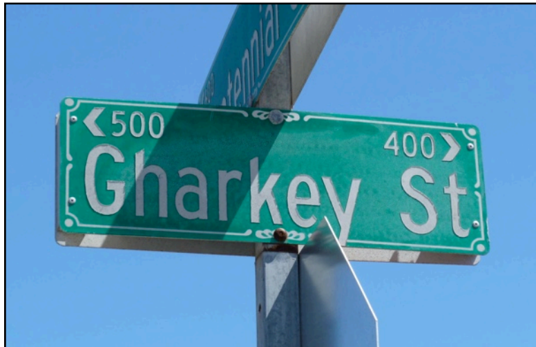
The spelling of "Gharkey" Street is probably an error. The most authoritative sources spell it without the "e."