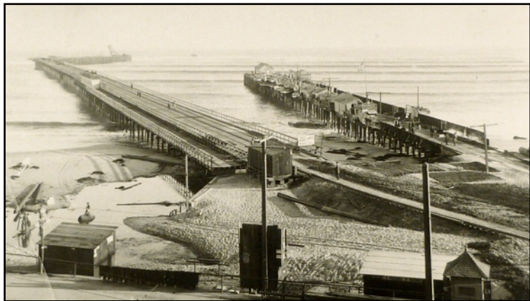
New Municipal Wharf (left) and old Railroad Wharf, 1914.