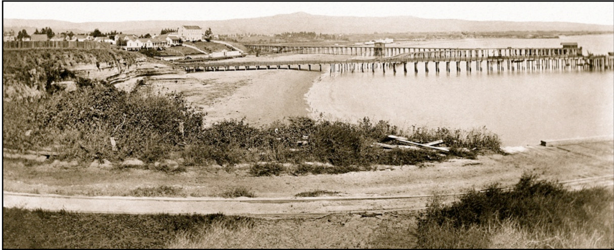
The Powder Mill Wharf (in distance) and Railroad Wharf with Connecting Wharf between the two. Photo taken from top of Cowell Wharf between 1877 and 1882.