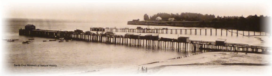
Railroad Wharf (foreground) and Cowell Wharf, c1890s