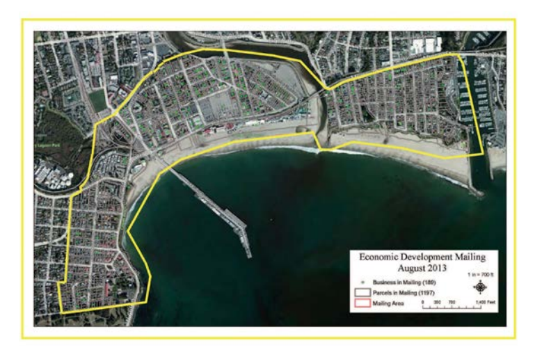
Mailing Zone for September 9, 2013 Focus Group Meeting with Neighbors and Businesses