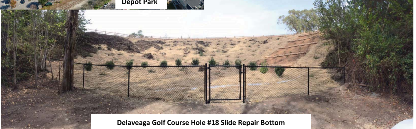
Delaveaga Golf Course Hole #18 Slide Repair Bottom