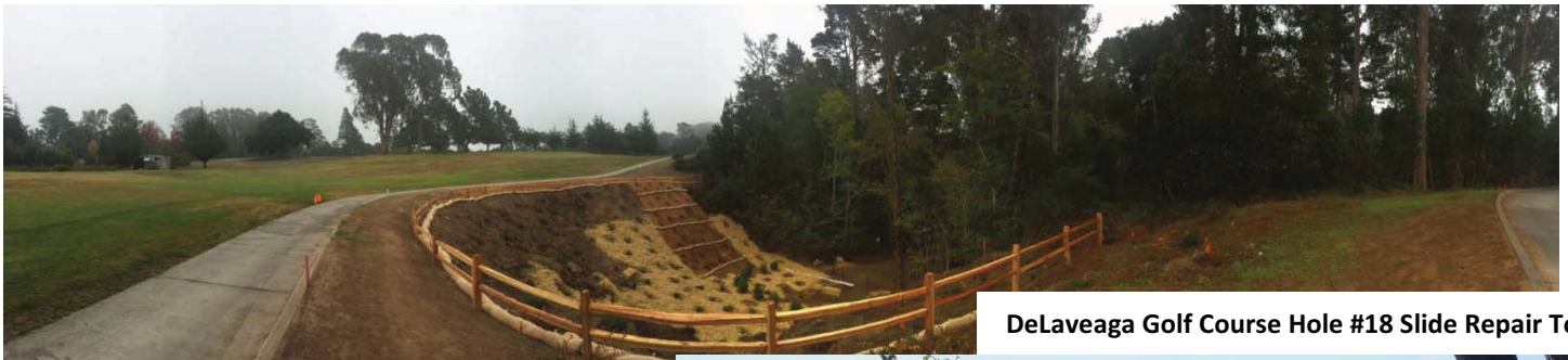
DeLaveaga Golf Course Hole #18 Slide Repair Top