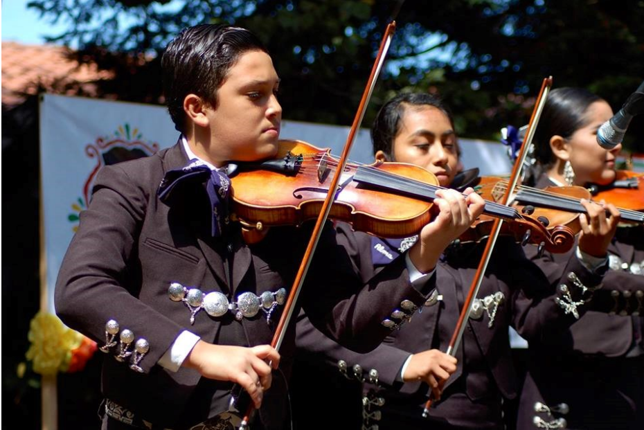
Mariachi Alma de Mexico