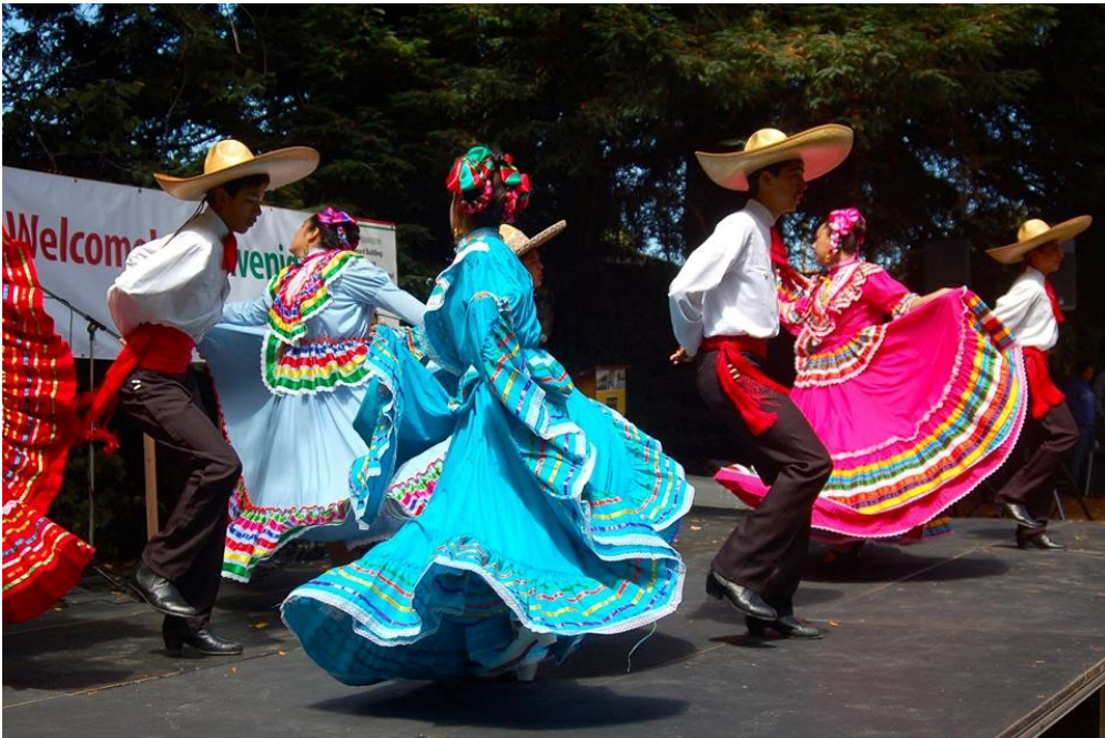
Estrellas de Esperanza Dancers