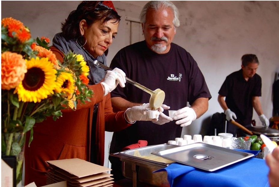
Mole Contestant El Jardin Restaurant serving mole samples to guests.