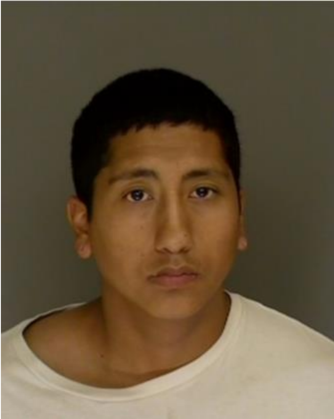
Case 18S-04264