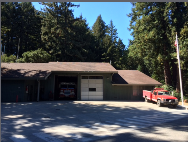
UCSC Station 4