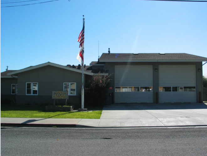
Station 3 West Side