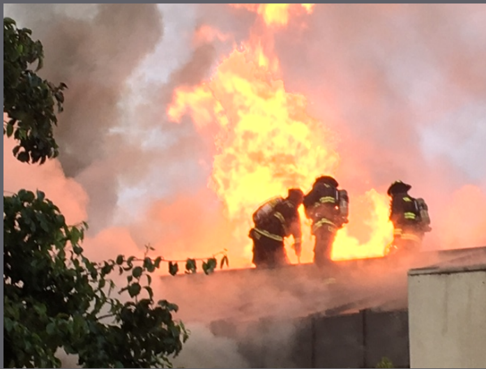
Santa Cruz City Fire Department working at a second alarm structure fire on Water Street