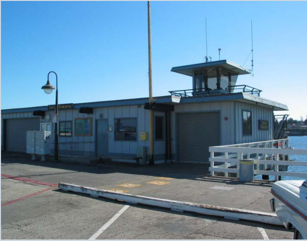
Lifeguard Station on the Wharf