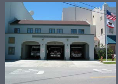
Station 1 Downtown

The Fire Department's primary objective is to provide the highest quality Fire Operations, Emergency Management Services, Marine Safety, Emergency Medical Response, and Community Risk Reduction to protect our community.