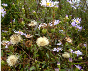
2008 Zoya Akulova