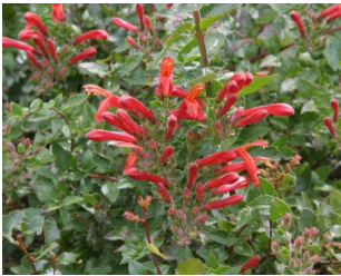
2016 Steven Thorsted

“ Thrift Seapink ” In the wild, thrift or sea pink commonly grows in saline environments along coastal areas where few other plants can grow well, hence the common name. If planted in its native coastal strand, this plant needs no supplementary irrigation after established.