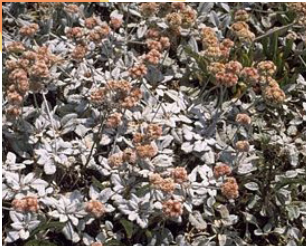
1995 Saint Mary's College of CA

“California Aster” is native to western North America from British Columbia to California, where it grows in many types of habitat, especially along the coast and in the coastal mountain ranges.