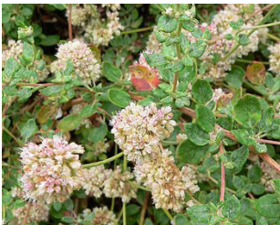
2006 Stan Shebs

“Bush Monkey Flower” is pollinated by bees and hummingbirds. The stigmas are notably sensitive and will close after being touched.