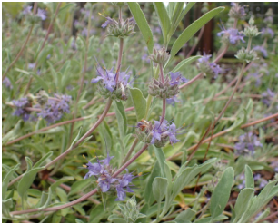
Taken with: Olympus Digital Camera

“Coast Buckwheat” this is a perennial herb which is quite variable in size and flower color, depending on its location along the coast and degree of exposure to the stiff maritime winds of its habitat.