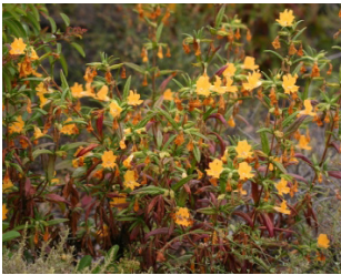
2017 Michael O'Brien

“Douglas Iris” it is most common in grasslands near the coast. It is more drought tolerant near the coast where it benefits from cooler temperatures and fog. The flowers can be highly variable in color.