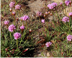
2017 Vernon Smith

“ Common Yarrow ” is a flowering plant in the Sunflower family, native to the Northern Hemisphere. Native Americans had many uses for the plant, including pain relief, fever reduction, and blood issues of all kinds.