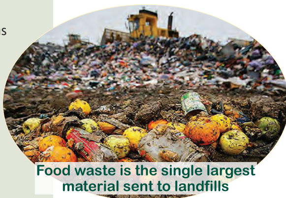
Food waste is the single largest material sent to landfills