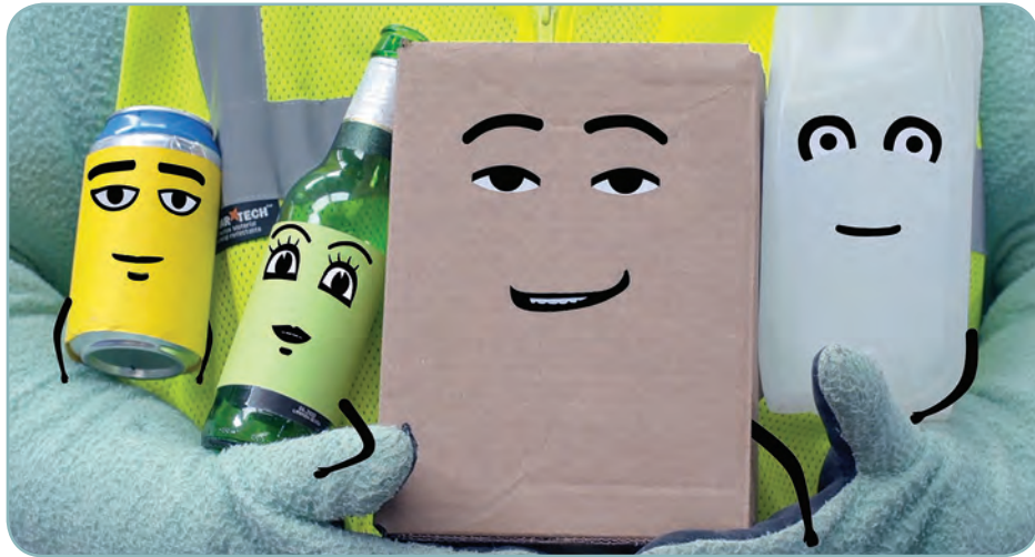
The video can be viewed in English and Spanish at www.cityofsantacruz.com/RecycleRight

with an entire truckload of recyclables. As all are sorted and processed for recycling there, eddy currents send aluminum cans flying through the air, a V-screen separates 2-D and 3-D items, and a giant magnet dramatically pulls out the metal-heads. The tour will be fun and educational for the entire family!