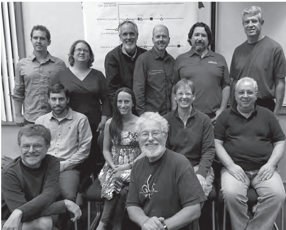
Members of the Water Supply Advisory Committee

Continue to work with Soquel Creek Water District on the design and construction of the PWS project, including possible opportunities for City projects.