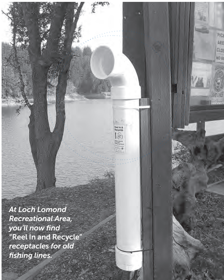
At Loch Lomond Recreational Area, you'll now find "Reel In and Recycle" receptacles for old fishing lines.

Be sure to ask one of our friendly Loch Lomond rangers where you can safely recycle your old fishing line.