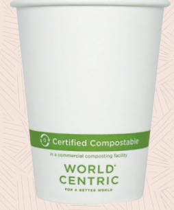
12 oz FSC® Paper Cup CU-PA-12