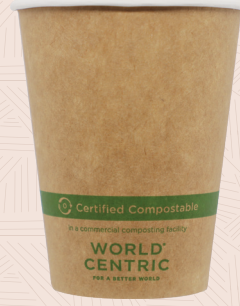
12 oz FSC® Kraft Paper Cup CU-PA-12-K