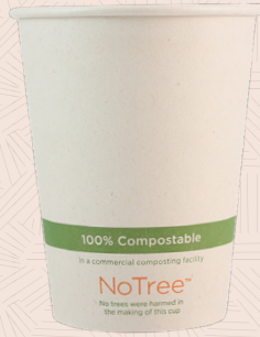
12 oz NoTree Paper Hot Cup CU-SU-12