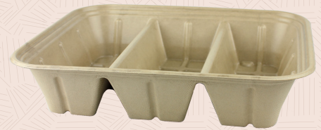
104 oz Catering Pan CA-SC-104TL-LF