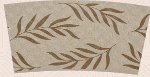
10-20 oz Paper Sleeve SL-PA-LG