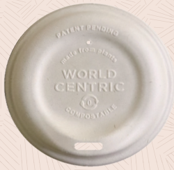
Fiber Lid CUL-FB-12-LF