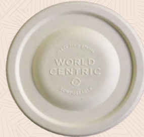
Fiber Lid BOL-FB-12-LF