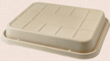
Raised Lid CAL-SC-104R-LF