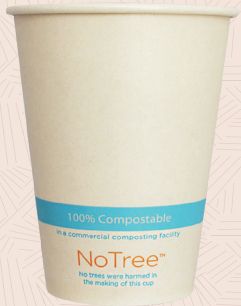
12 oz NoTree Cold Cup CU-SU-12C