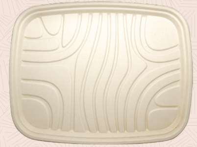
NEW Serving Tray TR-SC-1418-LF