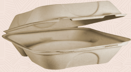
Clamshell, 3-Compt TO-SC-U8TL-LF