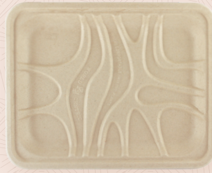
Produce Tray TR-SC-4SL-LF