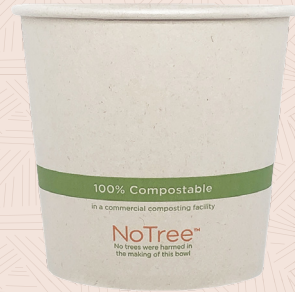
24 oz NoTree Bowl BO-SU-24