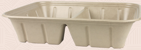
112 oz Catering Pan CA-SC-112DL-LF