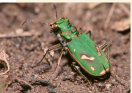
Ohlone tiger beetle

Moore Creek Preserve features high quality habitats, including wildflower fields, coastal prairie, rare examples of coast live oak, and riparian forest. A number of rare, threatened and endangered wildlife and plant species inhabit the property, including the red-legged frog, Ohlone tiger beetle, and the San Francisco popcorn flower.