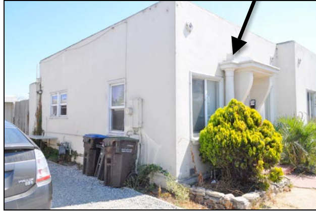
Figures 1 and 2. Left image shows the front (north) elevation viewed from the street. Right image details the front (north) and east elevations. The columns and decorative panels are not original to the building (arrow).