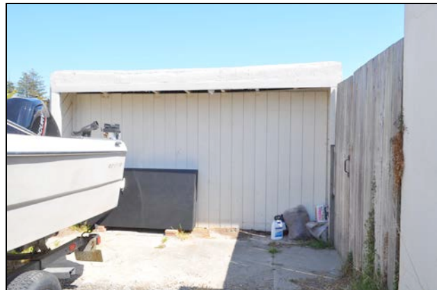
Figures 3 and 4. Left image shows the rear (south) elevation, with replaced windows and doors. Right image details the rear garage, which has a modified entrance containing a T1-11 door.