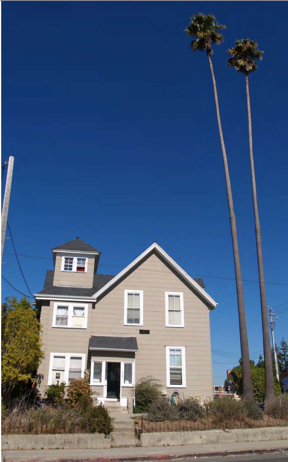
Side elevation from Broadway, viewed facing north.

* Recorded By F. Maggi/L. Dill/J. Kusz * Date 5/6/2009 Continuation Update