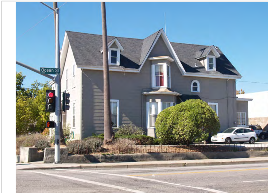
P5b. Description of Photo: (View, date, accession #) View facing west, 2009.

*P4. Resources Present: Building Structure Object Site District Element of District Other (Isolates, etc.)