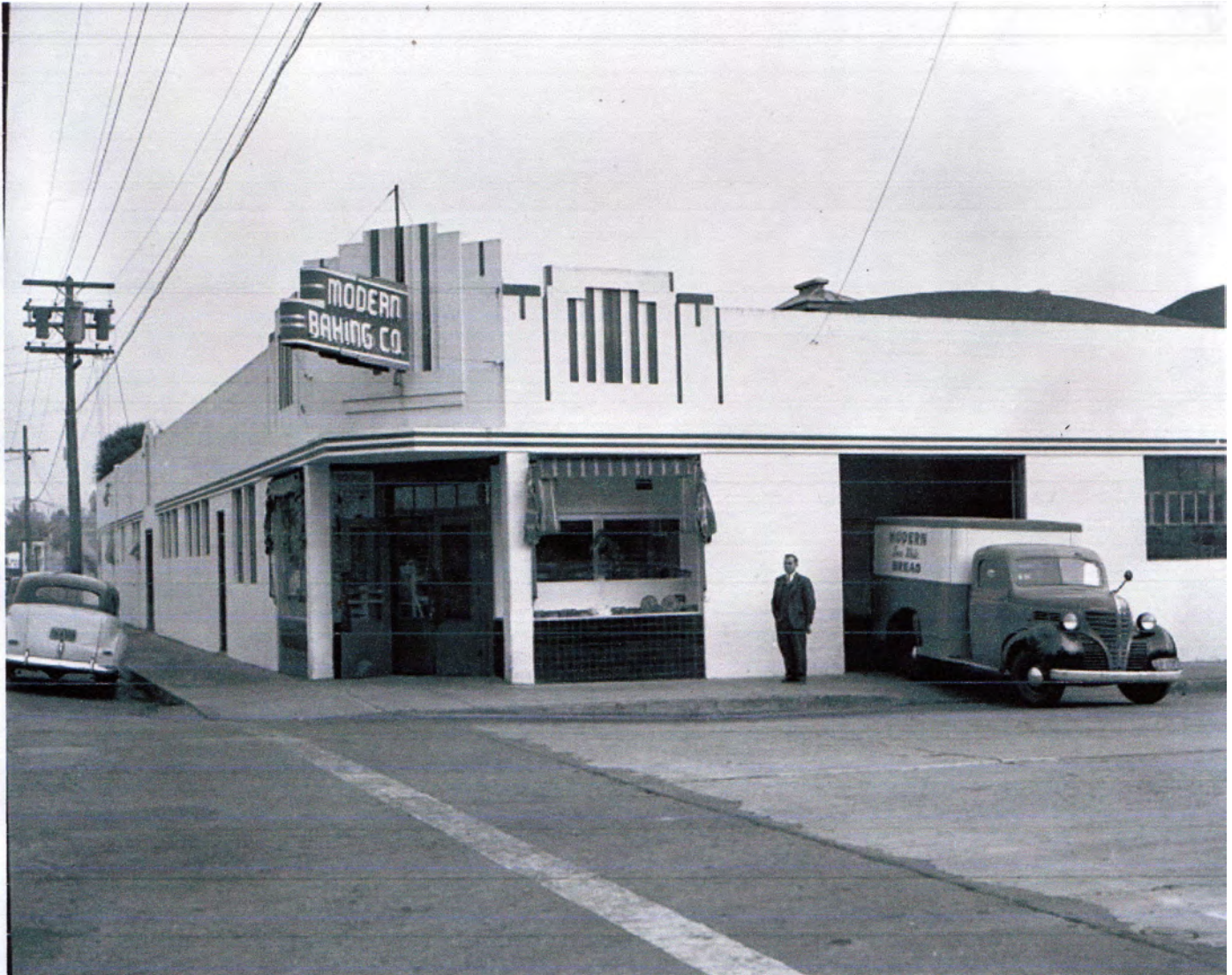
Historic photograph, viewed facing east from across Cedar Street.

* Recorded By F. Maggi/L. Dill/J. Kusz * Date 5/6/2009 Continuation Update