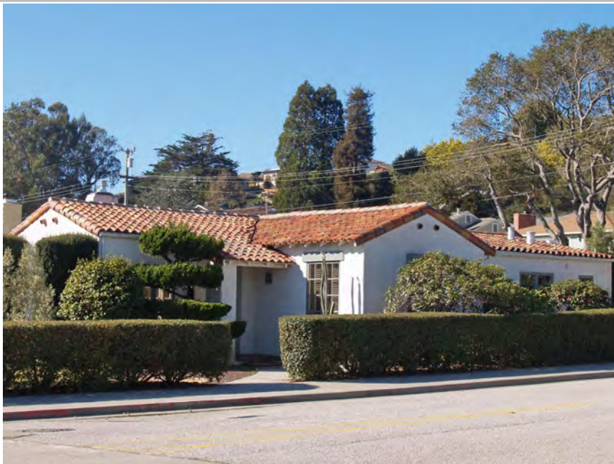
P5b. Description of Photo: (View, date, accession #) View facing northwest, 2009.

*P4. Resources Present: Building Structure Object Site District Element of District Other (Isolates, etc.)