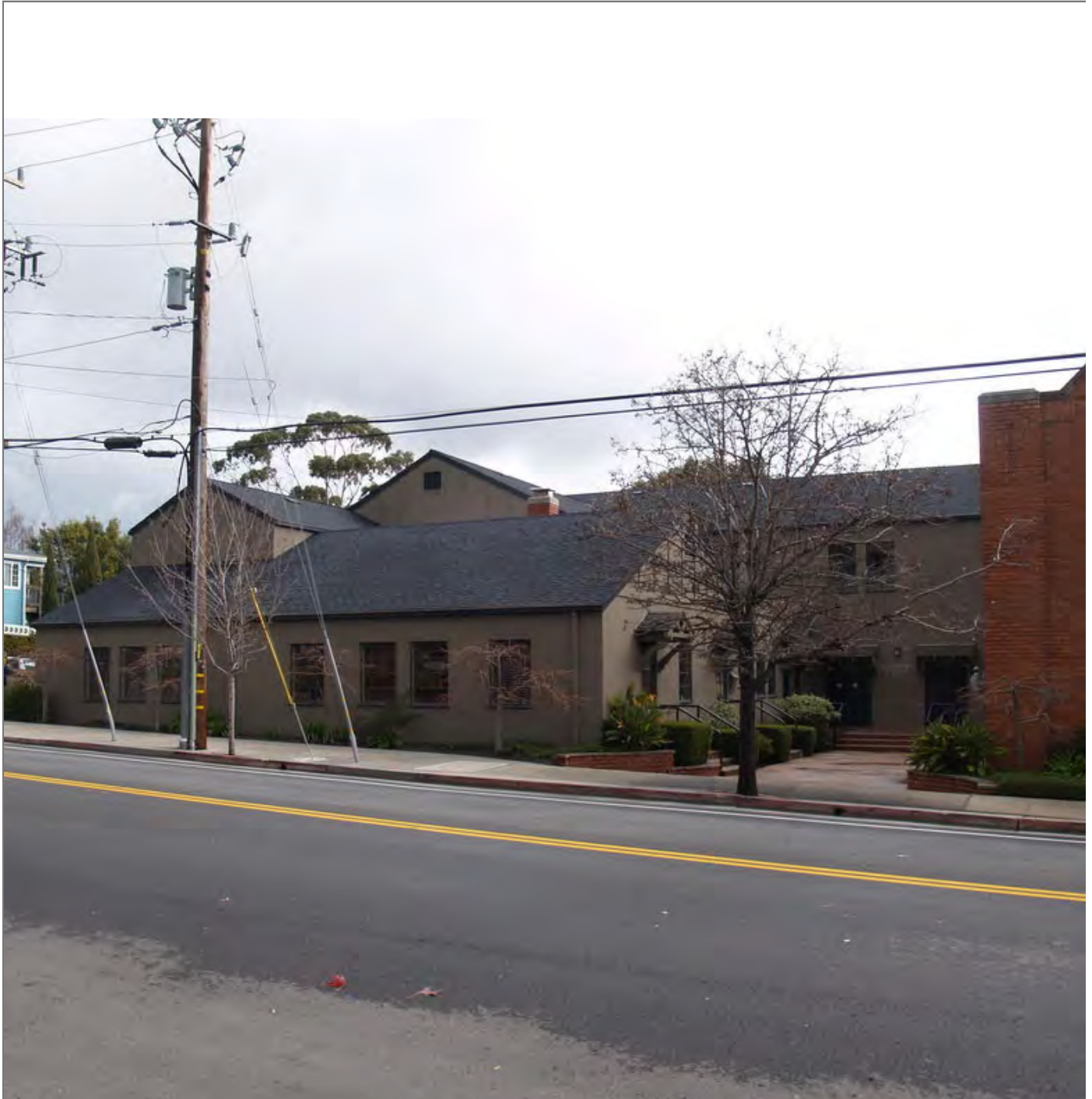
Highland Avenue elevation of rear buildings, viewed facing northeast.

* Recorded By F. Maggi/L. Dill/J. Kusz * Date 5/6/2009 Continuation Update