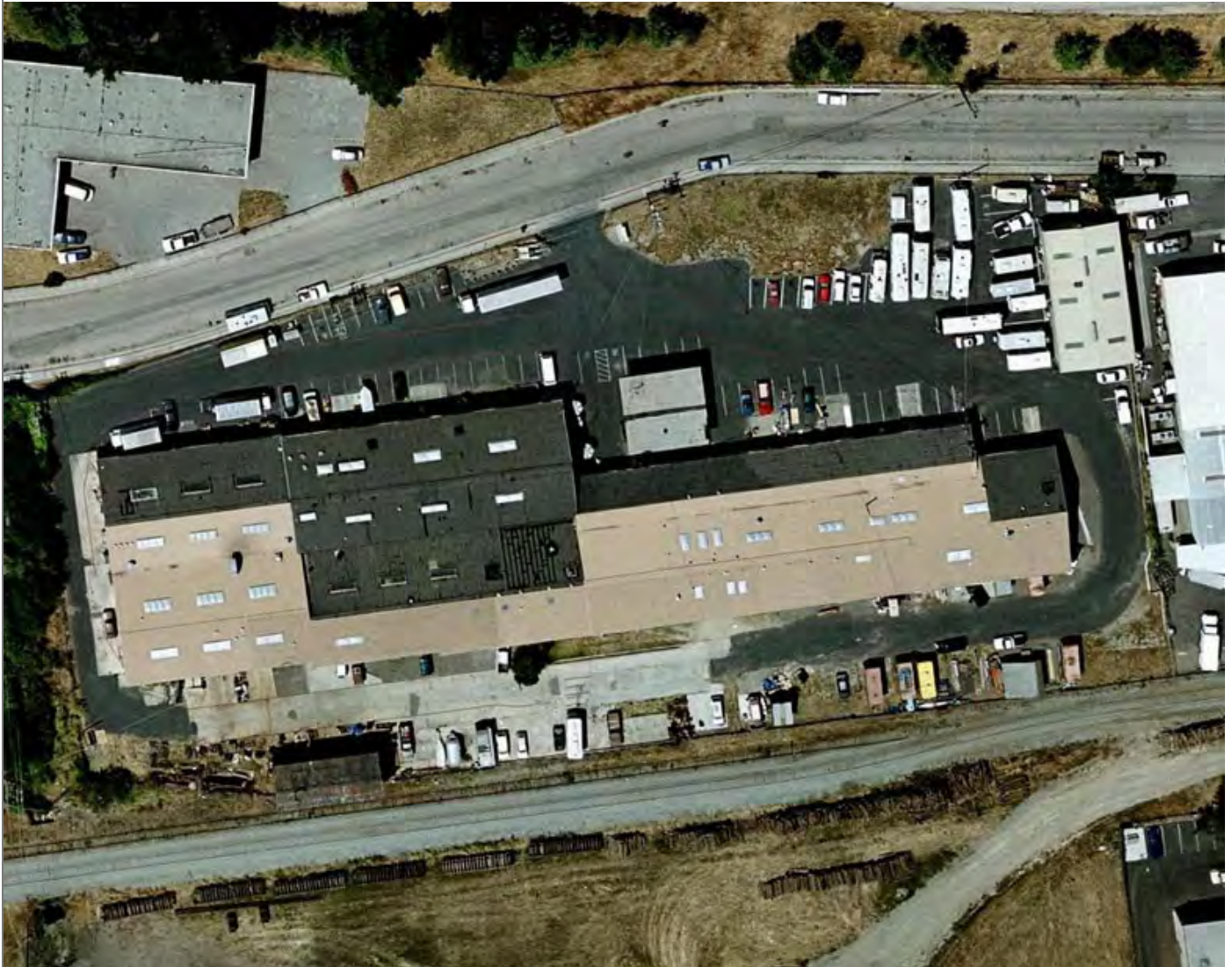
Aerial view of building complex.

* Recorded By F. Maggi/L. Dill/J. Kusz * Date 5/6/2009 Continuation Update