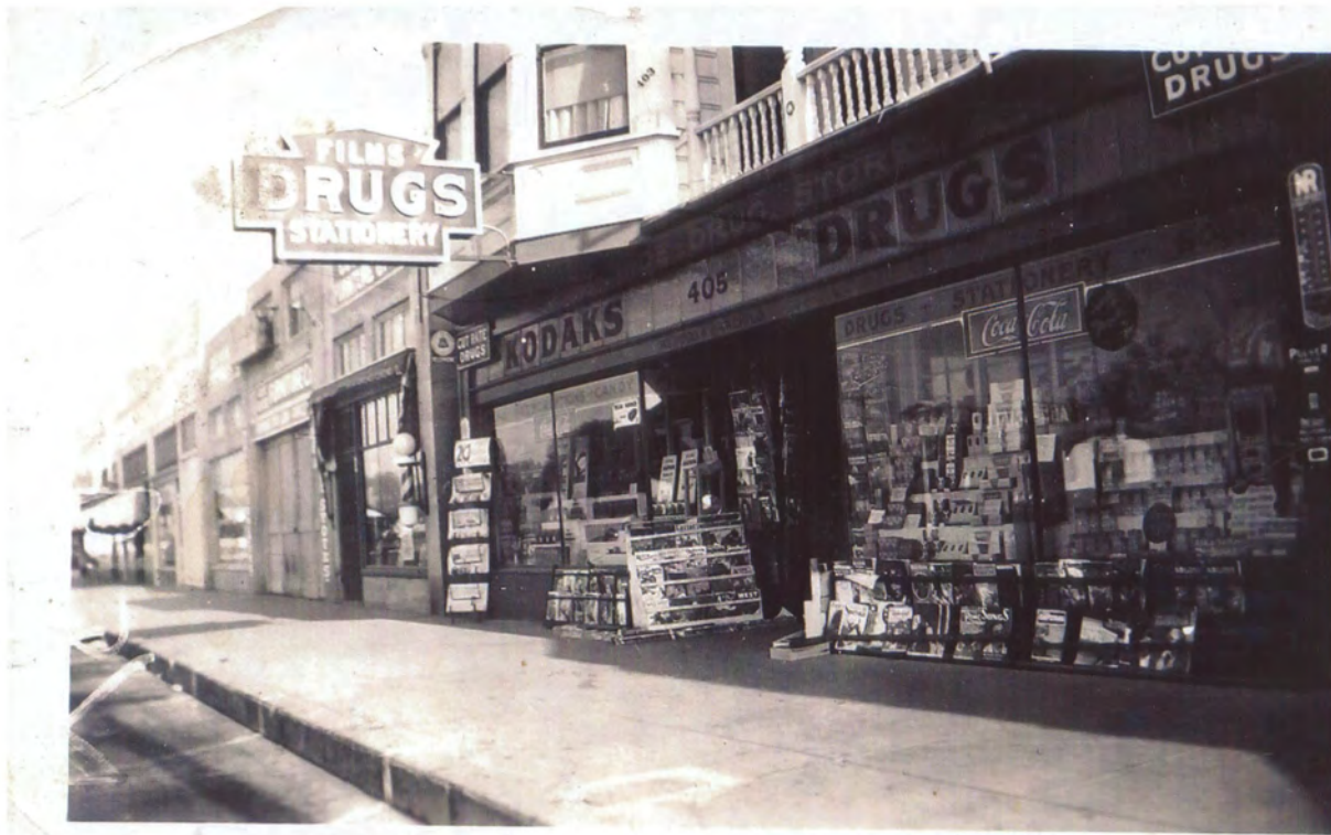
Historic photo of Eastside Drug Store.

* Recorded By F. Maggi/L. Dill/J. Kusz * Date 5/6/2009 Continuation Update