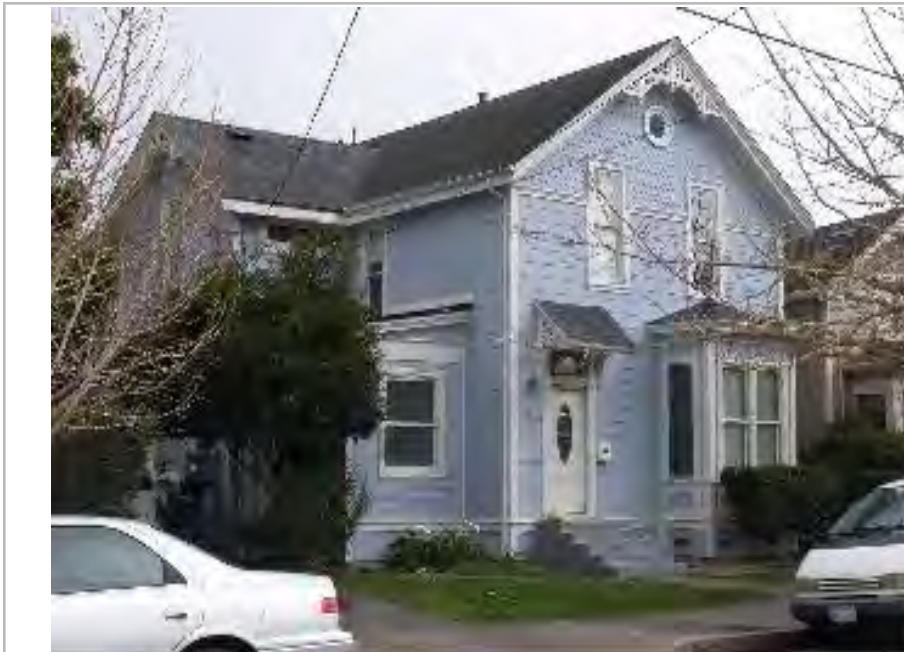
P5b. Description of Photo: (View, date, accession #) View facing east, 2009.

*P4. Resources Present: Building Structure Object Site District Element of District Other (Isolates, etc.)