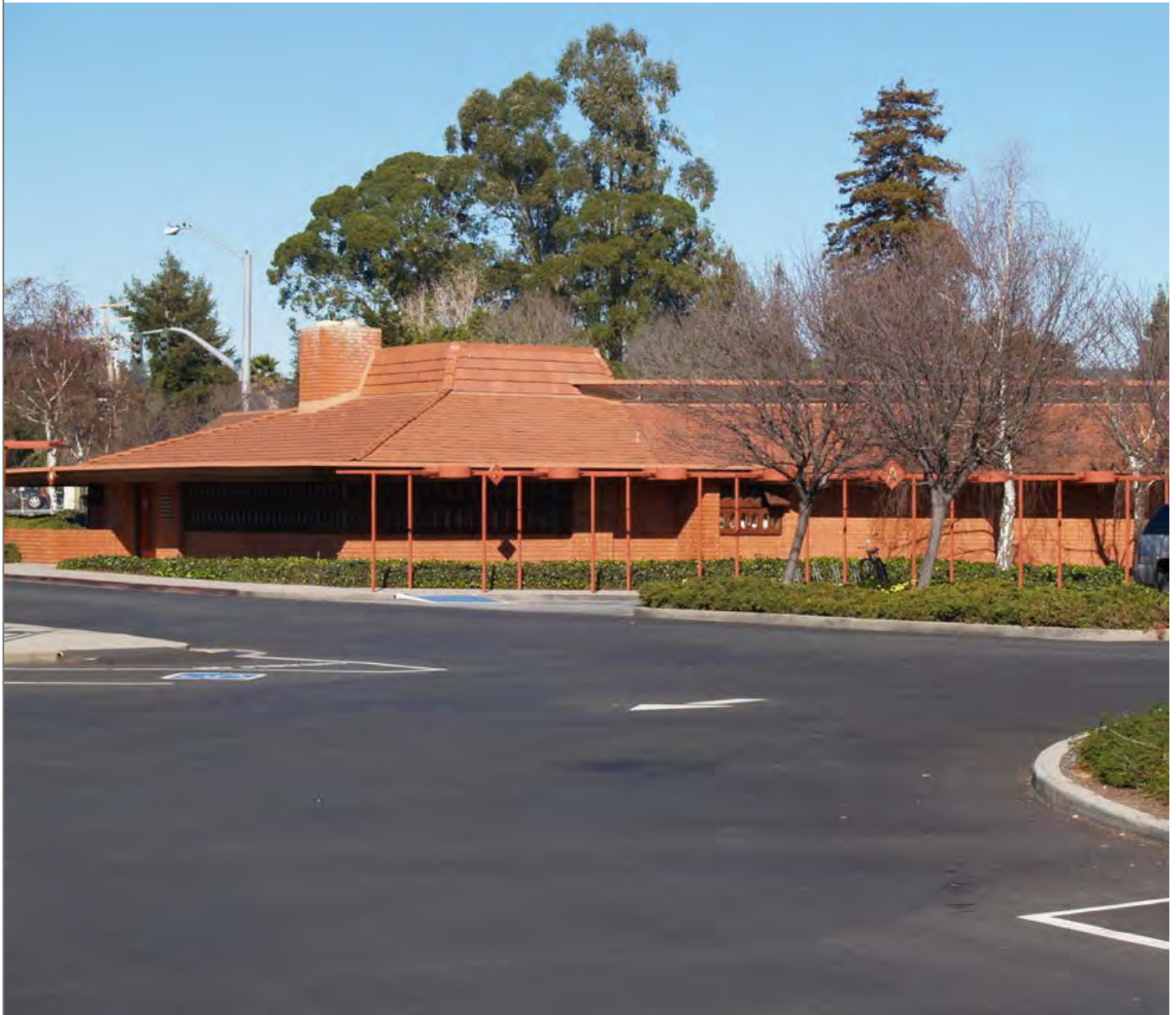
Detail view of most northeast buildings within complex, viewed facing northeast.

* Recorded By L. Dill/C. Duval/K. Oosterhouse * Date 5/6/2009 Continuation Update