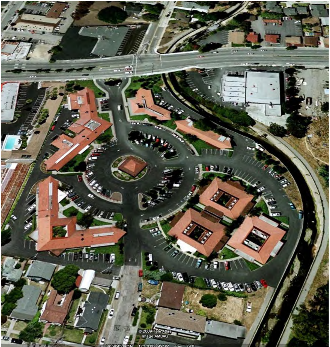
Aerial view of building complex.

* Recorded By L. Dill/C. Duval/K. Oosterhouse * Date 5/6/2009 Continuation Update