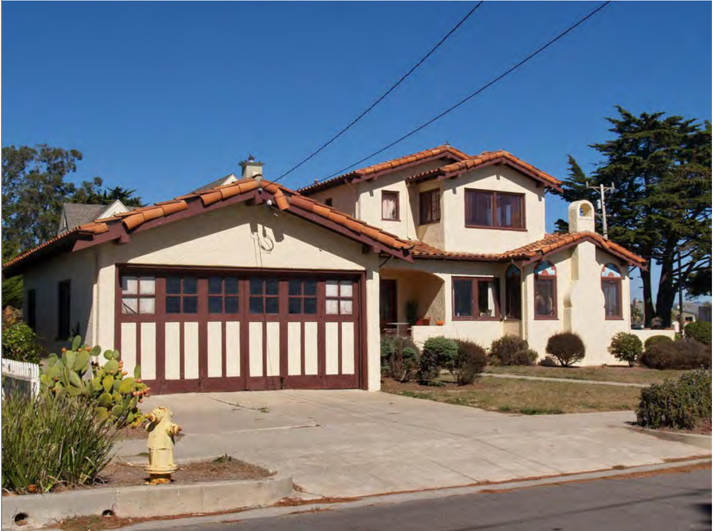
Elevation from De La Costa Avenue, viewed facing north.