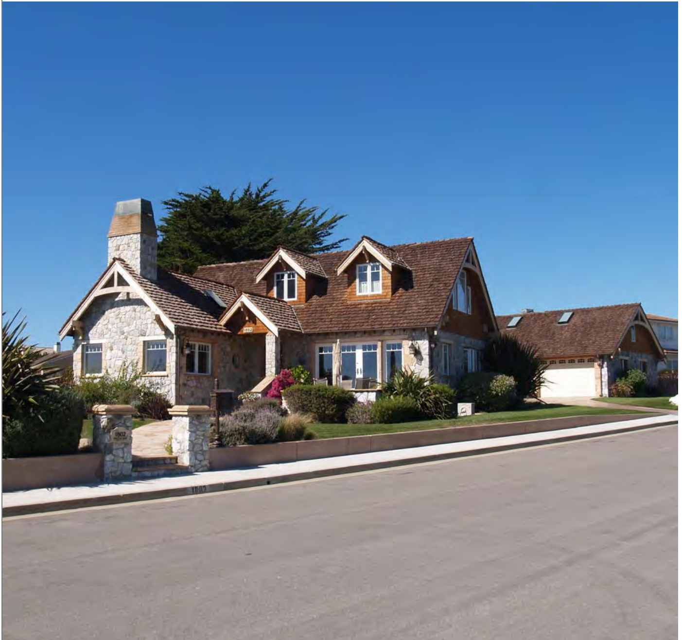
View from Stockton Avenue showing front entry, viewed facing northwest.

* Recorded By F. Maggi/L. Dill/J. Kusz * Date 5/6/2009 Continuation Update