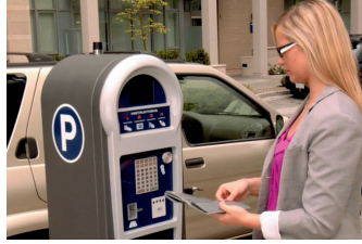
Multi-Space Pay Station Pilot