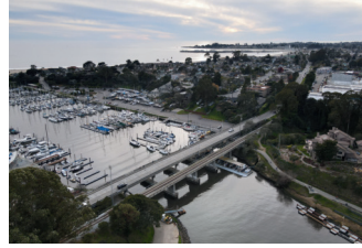
Murray Street Bridge Seismic Retrofit