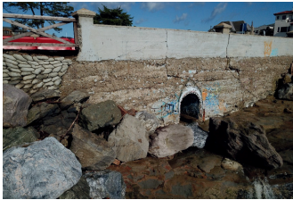
West Cliff - Bethany Curve Culvert Project