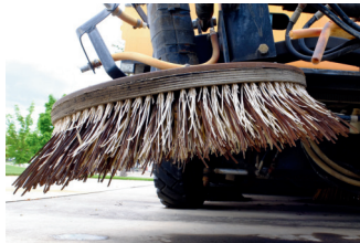
Street Sweeping Pilot Program