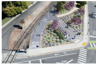
Rail Trail Segment 7 Phase II