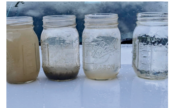
Recycling Center Stormwater Quality Improvement